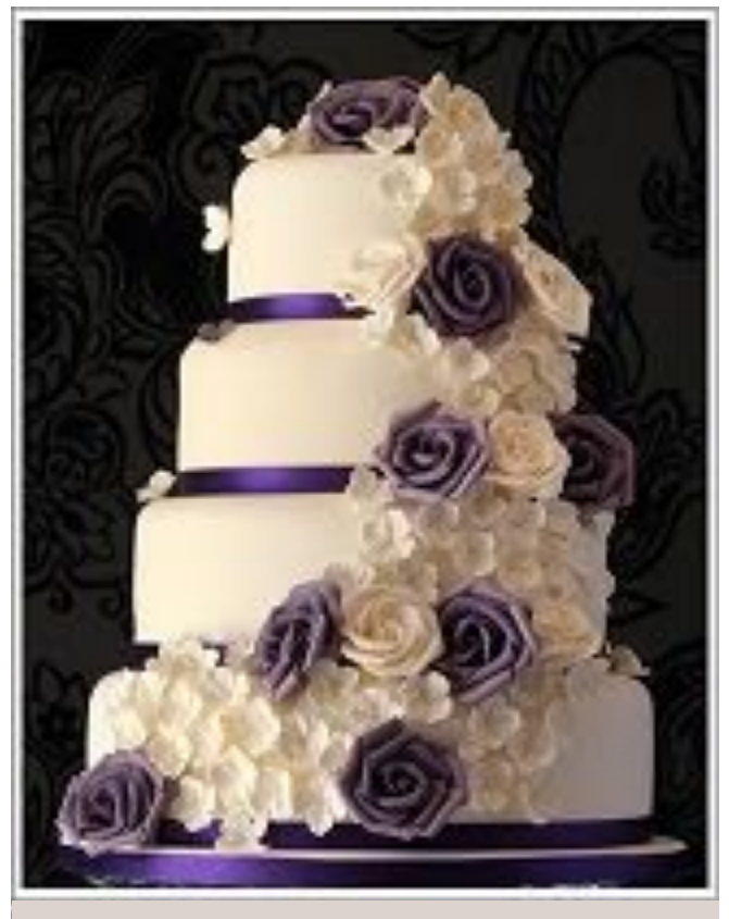
Cake 5 - Price: POR