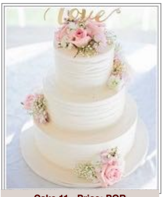
Cake 11 - Price: POR