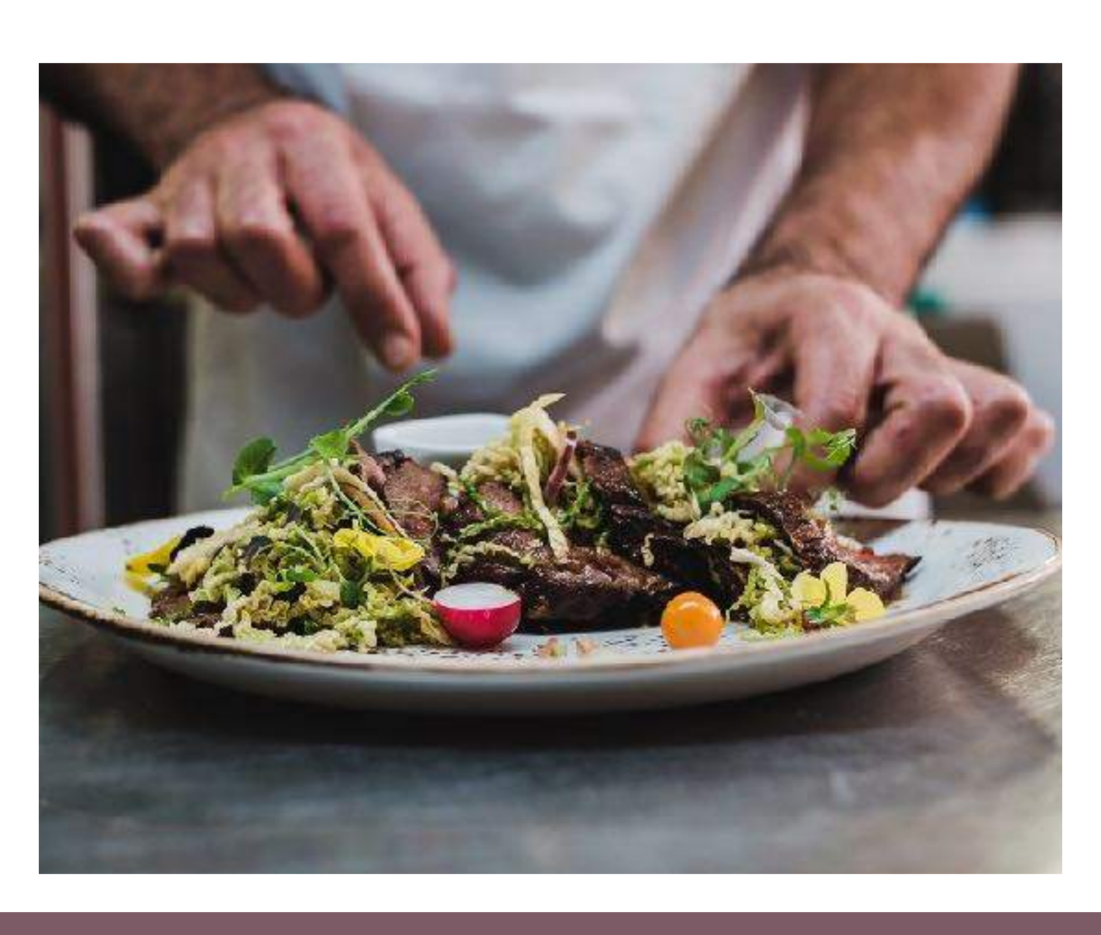
Perfection... is a lot of little things done right