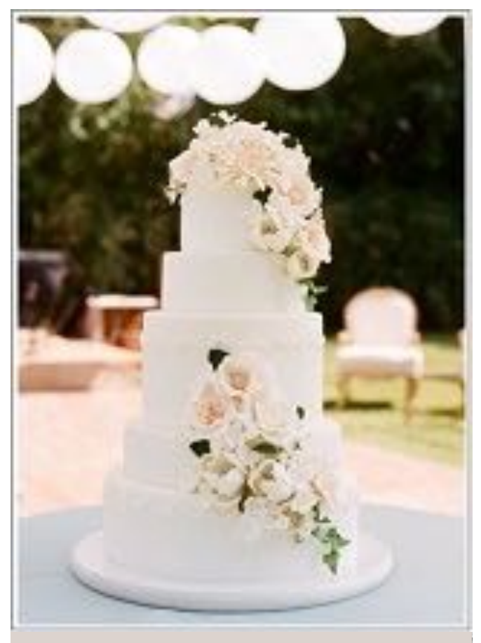
Cake 1 - Price: POR