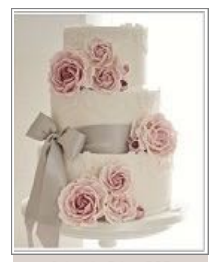
Cake 12 - Price: POR