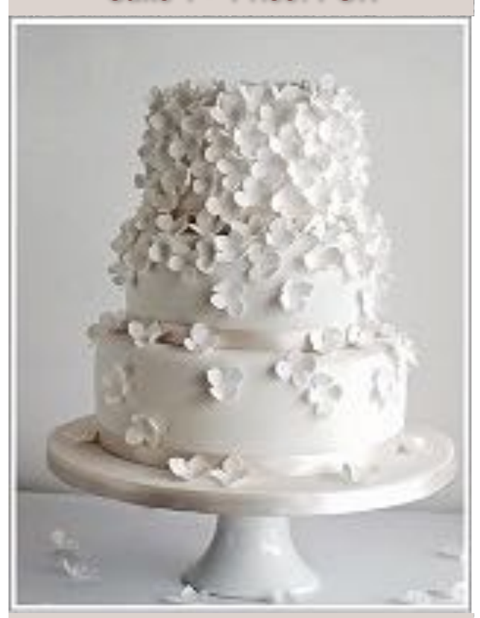
Cake 3 - Price: POR