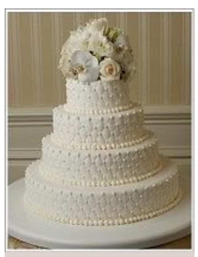
Cake 6 - Price: POR