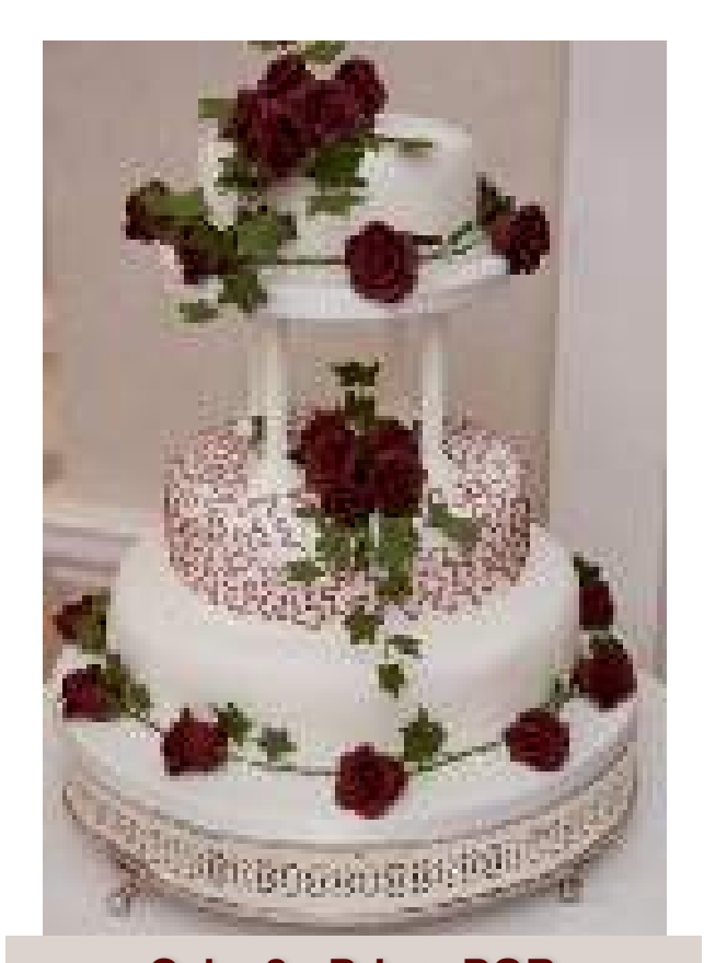
Cake 8 - Price: POR