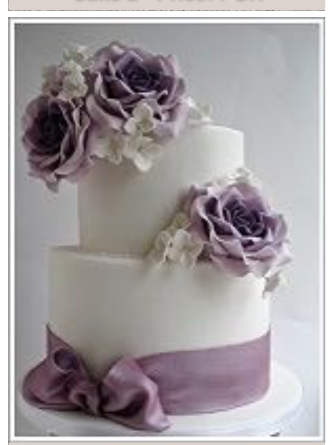
Cake 4- Price: POR