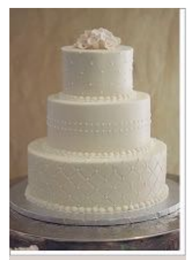
Cake 2 - Price: POR