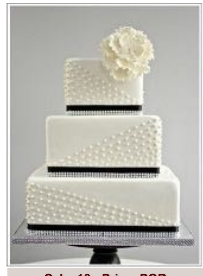
Cake 10 - Price: POR