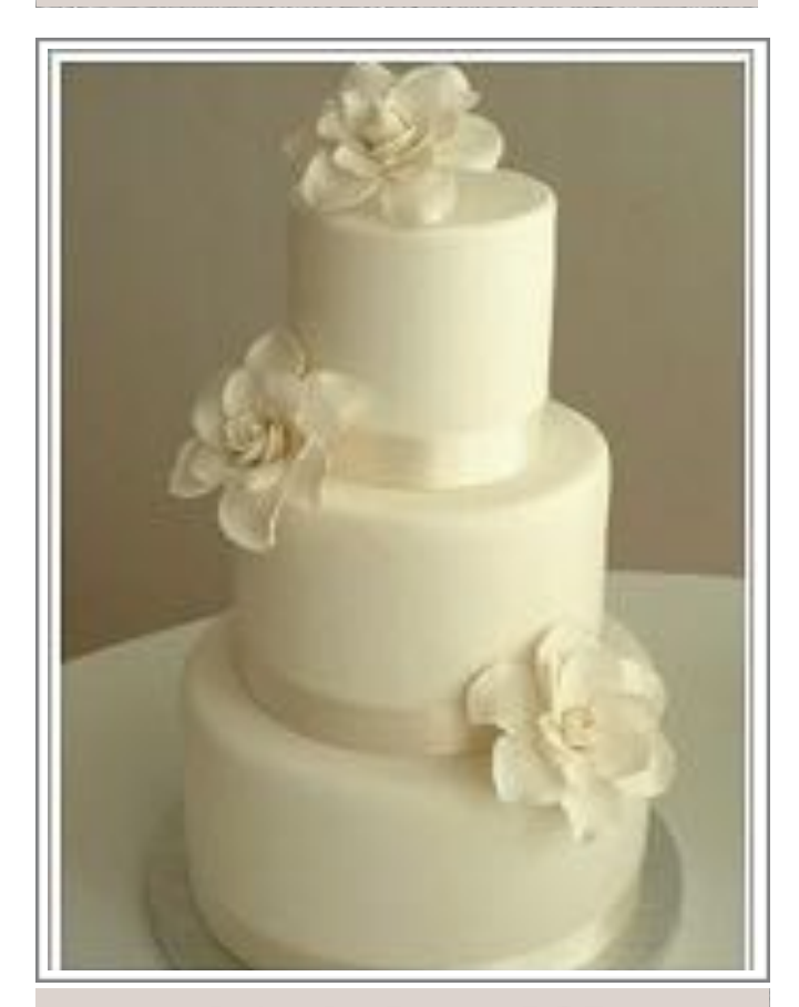
Cake 7 - Price: POR